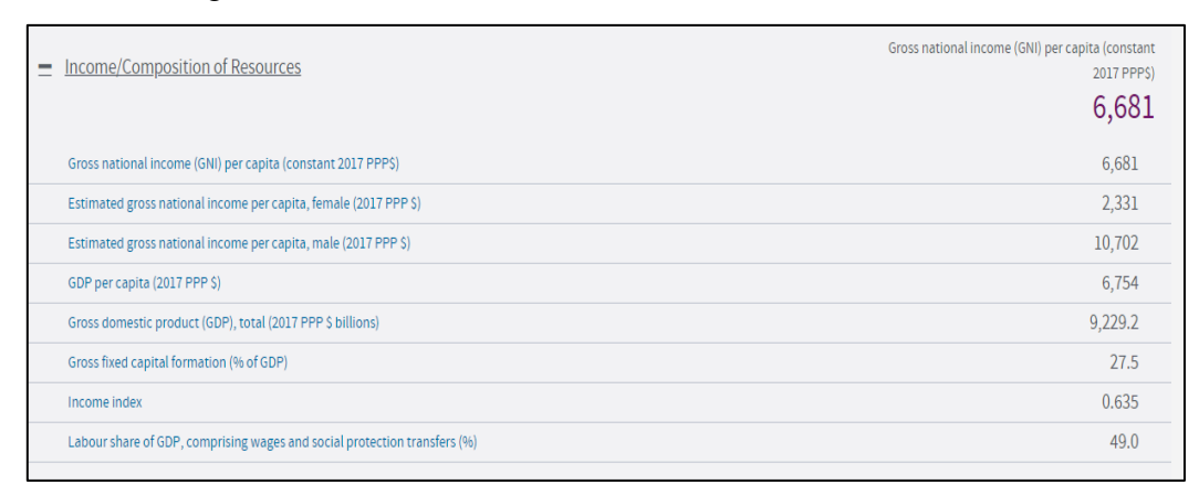
Figure 1.3: Composition of Resources

c. Composition of Resources: The Gross National Income (GNI) is at 6,681, which happens to be moderate as compared to other developing countries and lower as compared to most of the other developed nations. The UNJ development statistics reveal the following numbers: