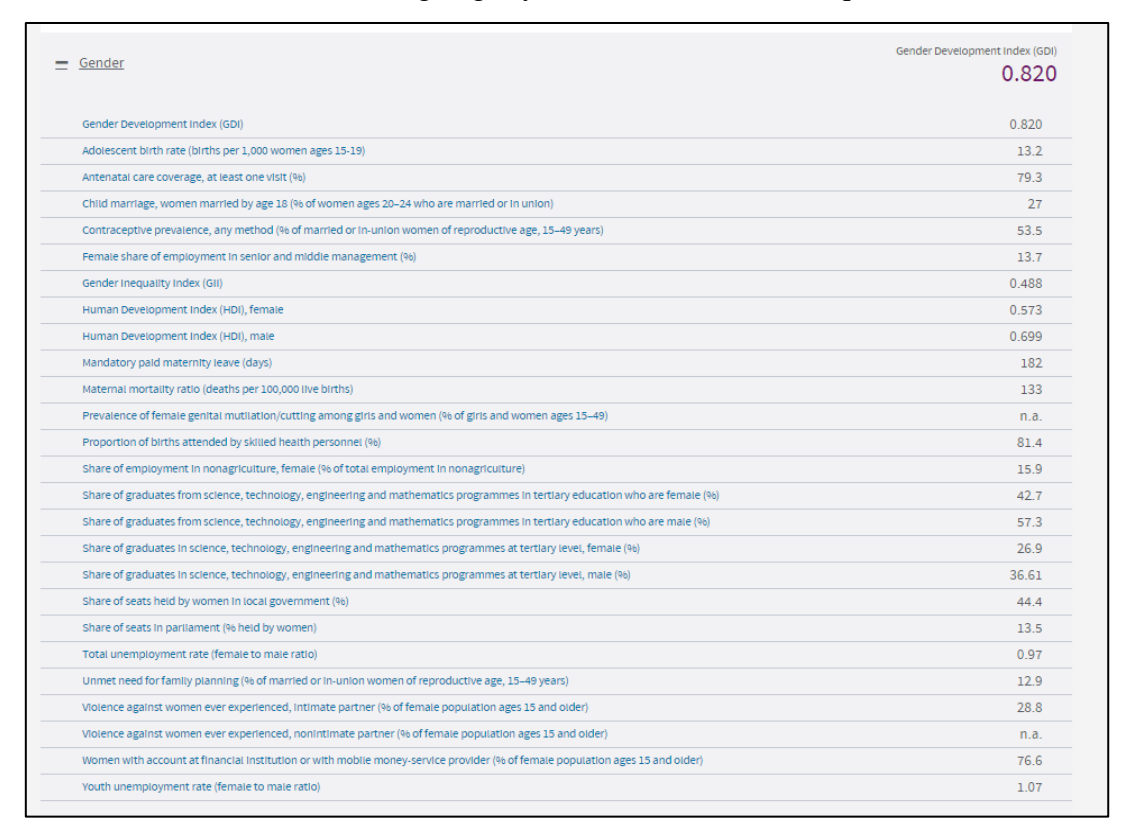
Figure 1.5: Gender distribution ratio Copyright © 2021, Scholarly Research Journal for Interdisciplinary Studies

e. Gender Ratio: The gender development index in India stands at 0.820 currently with the female to male ratio being slightly inclined towards inadequate as follows: